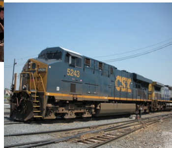
CSX Enforcement Locomotive