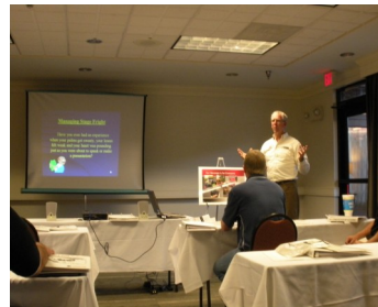
New Presenter Class in Indianapolis on Oct. 20, 2010

tations in schools and classrooms to students, the classroom teacher or other appropriate school personnel must remain in the classroom at all times with the OL presenter.